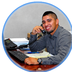
Request a Training Class