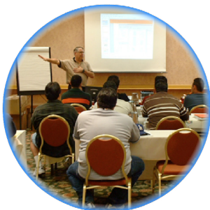
GTH Training Class List

The George T. Hall Company has over 86 years of industry experience and our personnel are well-trained on the latest technology advancements in our field. Contact your local GTH sales office today or click on the links below for more information!