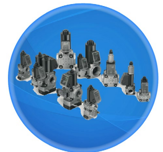
Krom Schroder Solenoid Valves