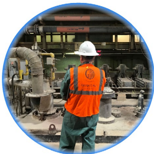
GTH Combustion Solutions

Contact your local GTH sales office today for more information on Krom Schroder or Honeywell Thermal Solutions.