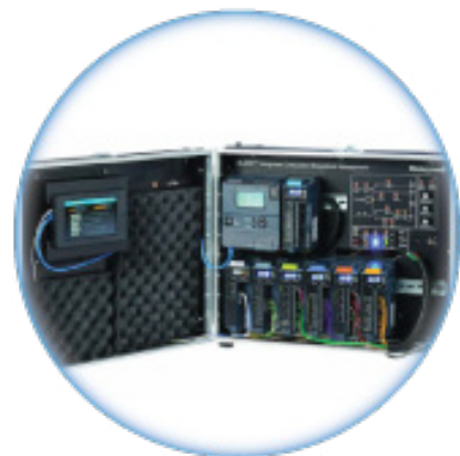
Check out the new display case