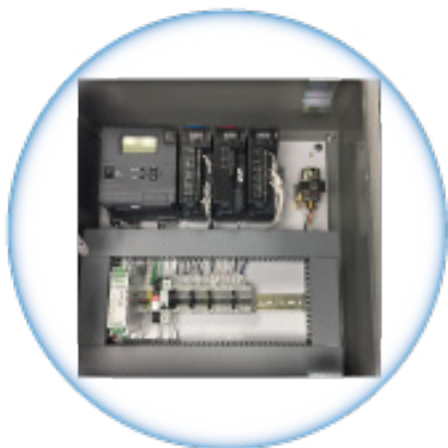
GTH Control Panel Integration