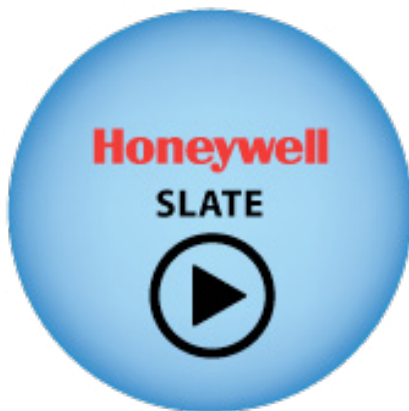
Watch a demonstration